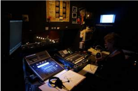
Sound & lighting