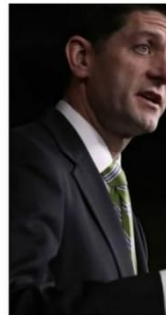
The organisers of two privac say they plan to buy, then se browsing histories of some o best-known politicians.

Campaigners s sell US politica browsing data' entertainment