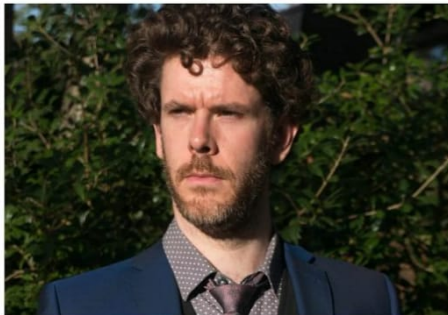
Duke Orsino will be revealing new defences against piracy developed with the Arion Centre in the near future.

Duke Orsino finally reacts to controversy about feeble response to pirate threat